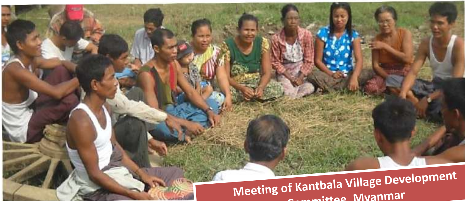
Meeting of Kantbala Village Development Committee, Myanmar